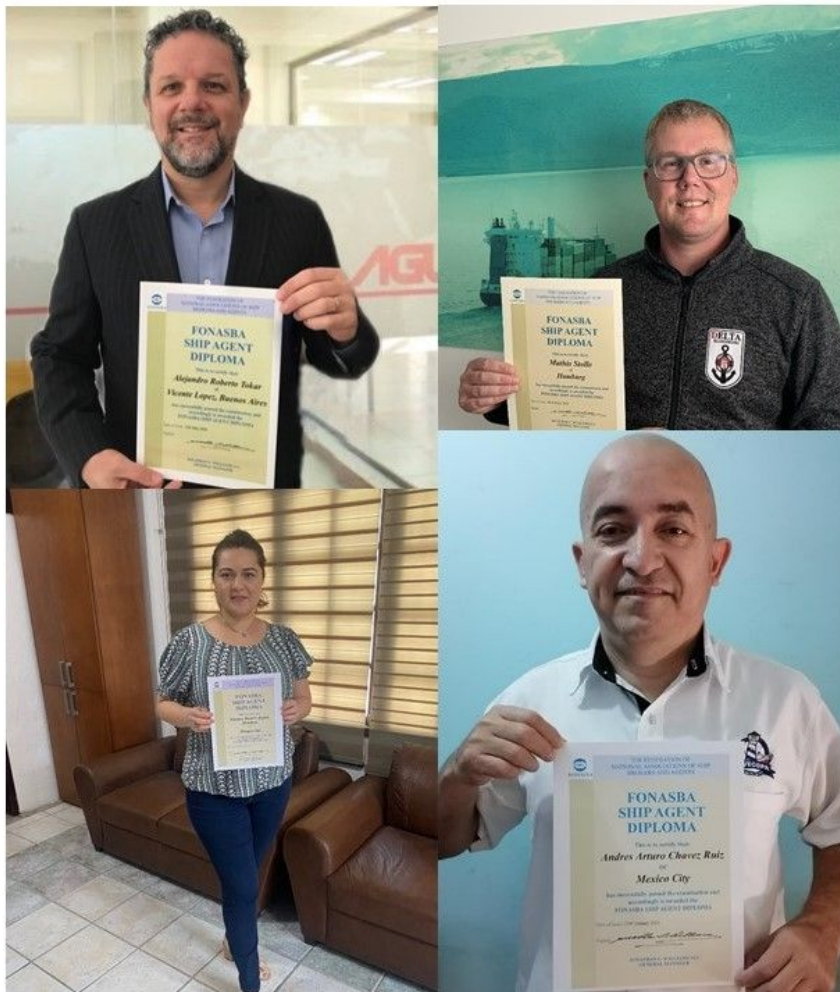
PHOTO PAGES: FOR MORE PICTURES GO TO OUR FACEBOOK PAGE ( www.facebook.com/fonasba )

Once again we have pleasure in acknowledging the success of new Agent Diploma candidates from (left) Argentina, Germany and Mexico and (below) Morocco. Our congratulations go to all of them.