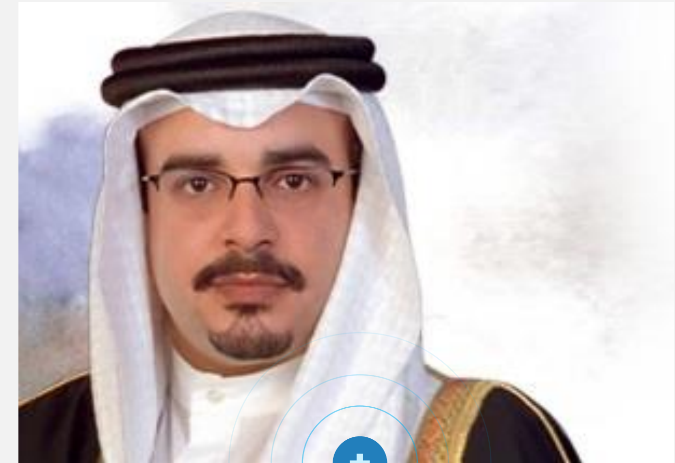
H.H. Shaikh Salman bin Hamad Al-Khalifa