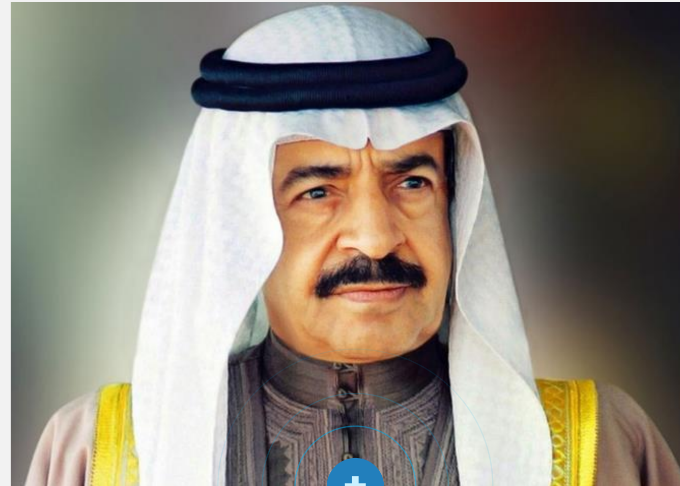
H.H Shaikh Khalifa bin Salman Al Khalifa