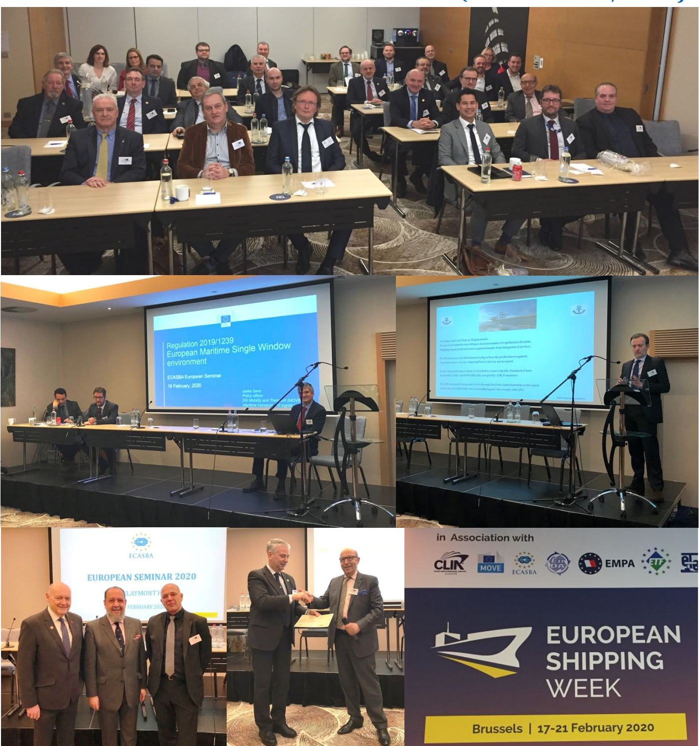
PHOTO PAGES: For more pictures go to our Facebook page (www.facebook.com/fonasba)

Top: Delegates and speakers at the ECASBA European Seminar 2020: